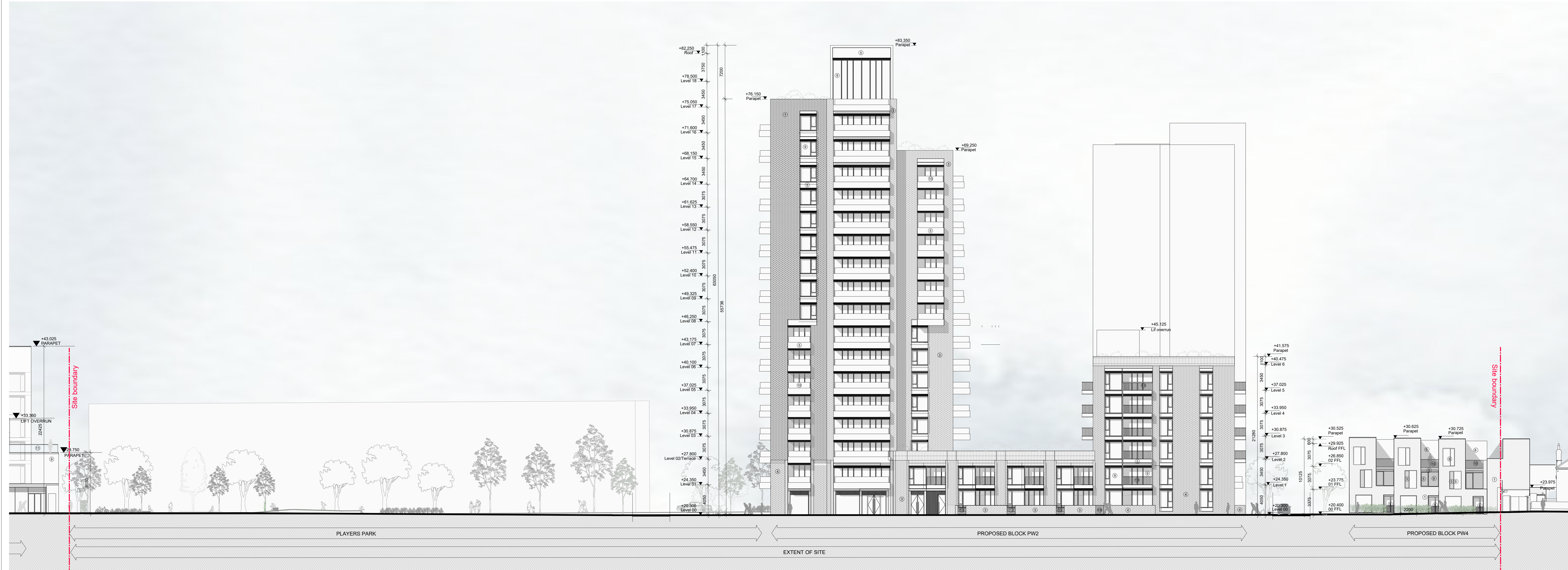
02 Elevation 03 - South Elevation PW2-PW4 SCALE 1:200